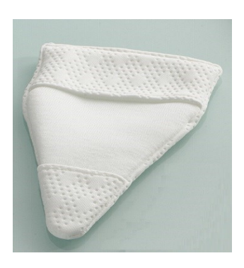
Padded Cover:Knit Polyester 2-ply pinsonic bonded